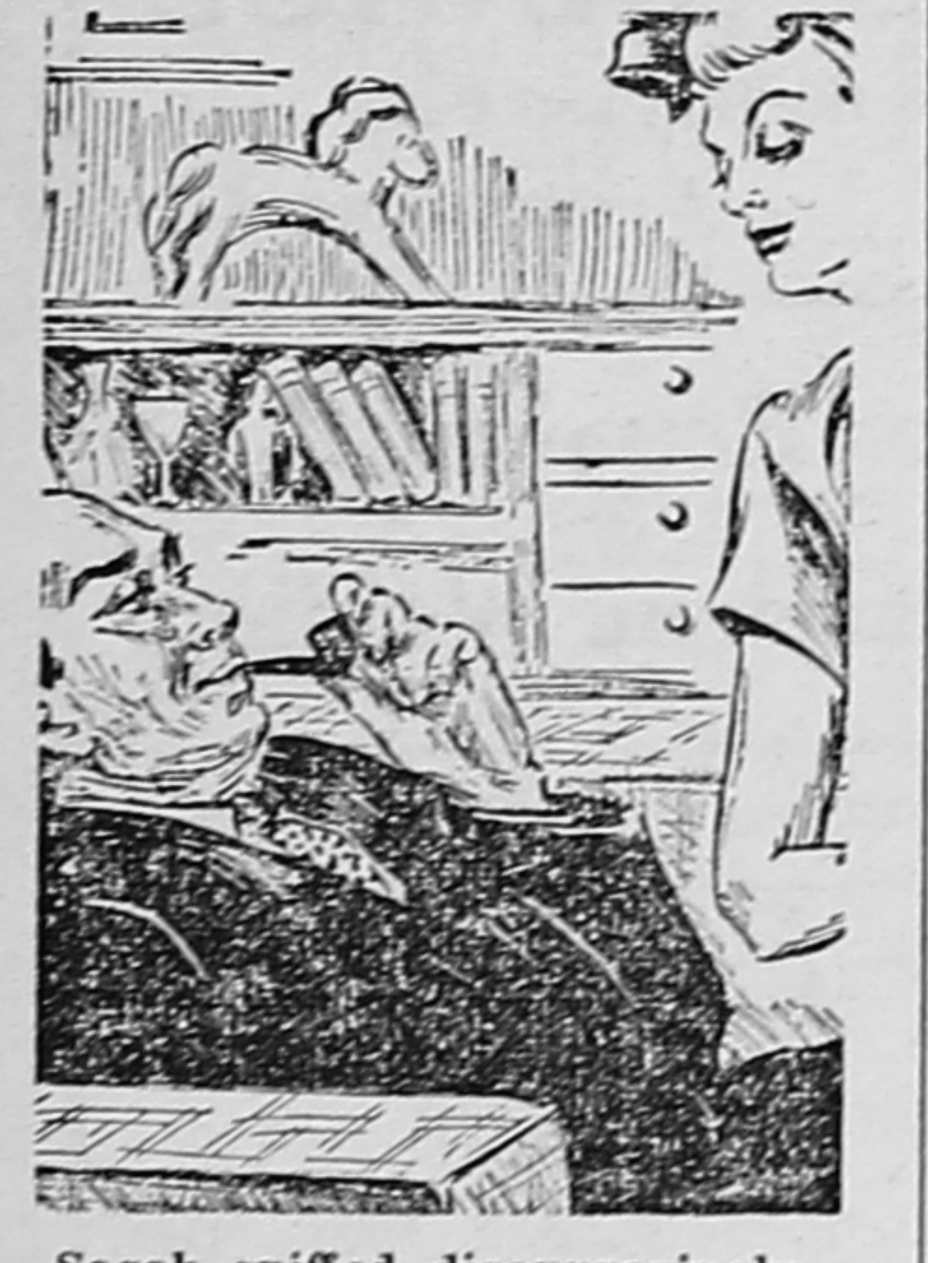
Sarah sniffed disapprovingly.

THE door opened and a stocky young man came in, dressed in a dark coat with the collar up about his ears and a slouch hat down over his eyes. Dressed rather warmly for such a day, Henry thought. "Yes, sir, what can I do for you?" he asked pleasantly. "Quiet in here today, isn't it?" the man said. "Very," Henry agreed. "Then put up your hands, bud, and open up that cash register," the man snarled, leveling a gun at Henry. Henry almost fainted with surprise and shock. His knees rattled against each other, and he was powerless to move. "Come on, hurry up," the man said brusquely. The roof of Henry's mouth was so dry and parched he thought he would choke. What should he do? He