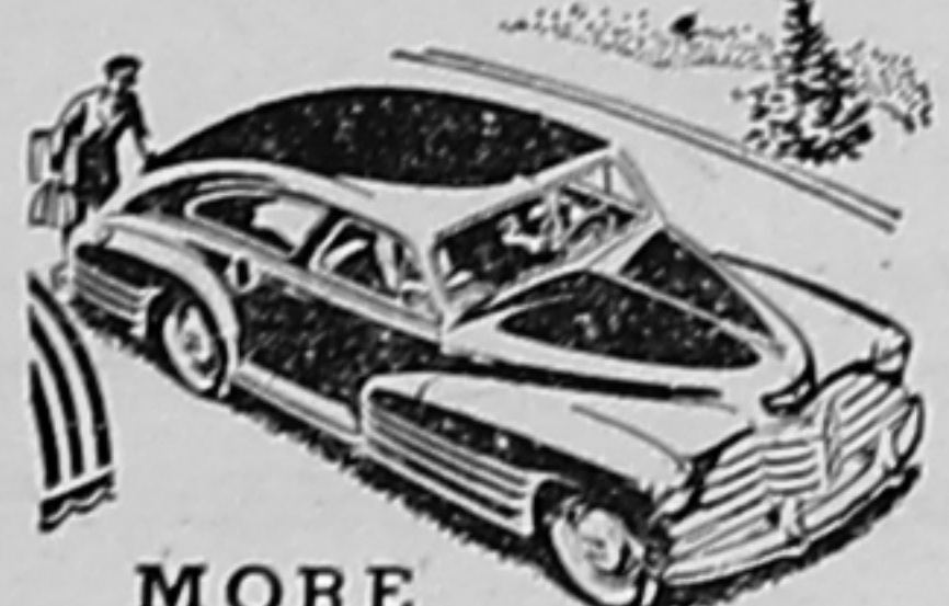
MORE VALUE in Riding Luxury

You'll enjoy lively, de- pendable road-action at lower cost per mile! Chevrolet's Valve-in- Head principle of engine design is available else- where only in higher- priced cars.