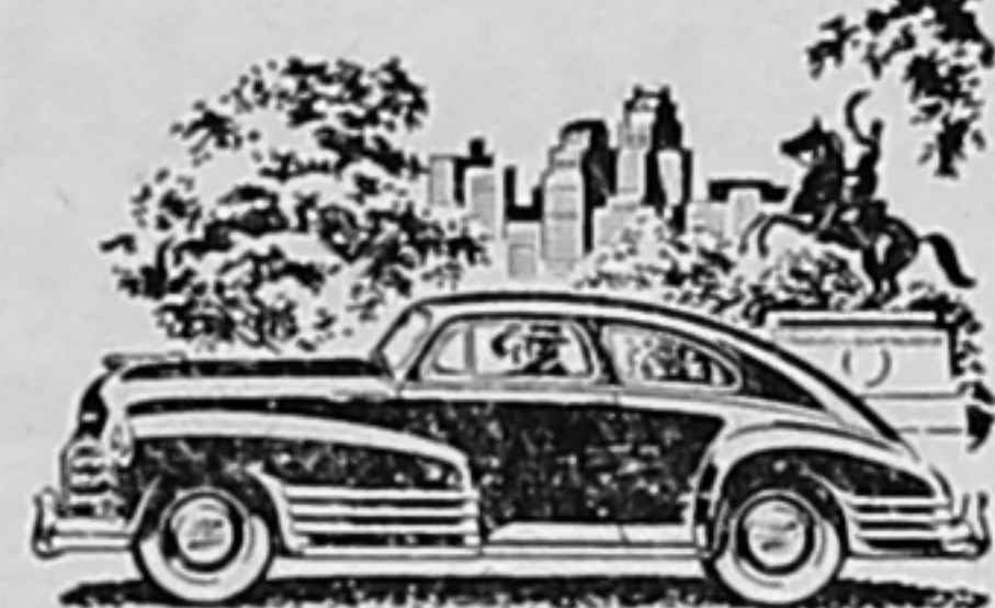
MORE VALUE in Tasteful Beauty

BREWER BROS. CHEVROLET SALES Homer, Ill.