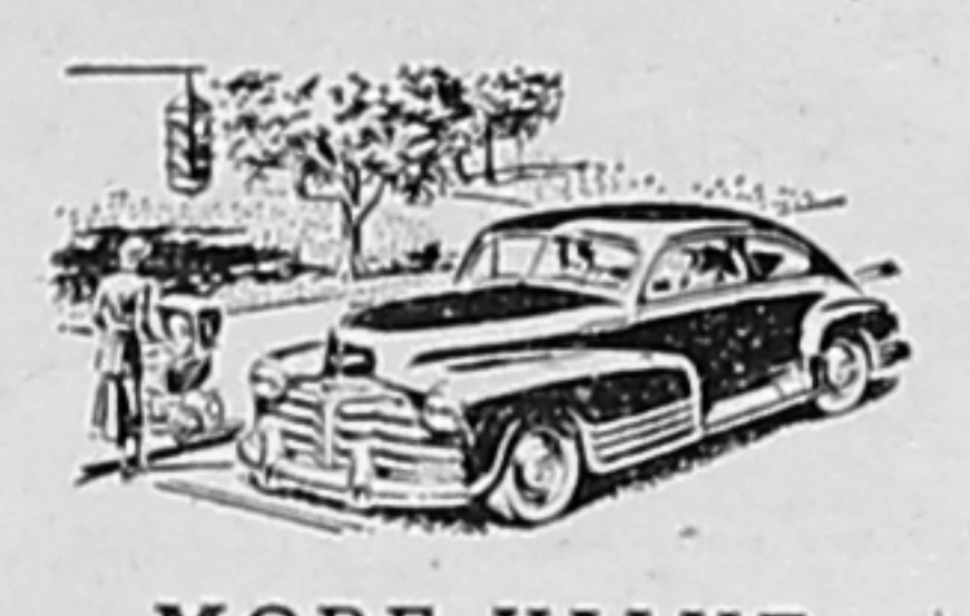
MORE VALUE in Safety Protection

Look at this smoothly- designed Chevrolet from every angle and you will find it uniformly beau- tiful. The Body by Fisher is another feature found only in Chevrolet and more expensive cars!