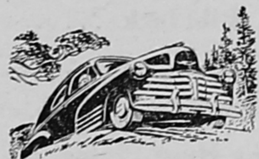
MORE VALUE in performance with economy

You'll enjoy lively, de- pendable road-action at lower cost per mile! Chevrolet's Valve-in- Head principle of engine design is available else- where only in higher- priced cars.